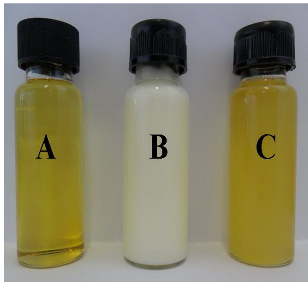
Fig 3. Examples of the association structures: (A) microemulsions, (B) emulsions and (C) gels, which could be formed when mixing of OO, W and 1:1 SMO:PSMO at different concentrations or at different areas in the phase diagram of Fig 2C.

If q > k_0 then Microemulsion = YES otherwise Microemulsion = NO.