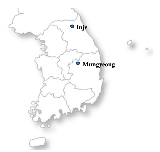
Fig. 1: Map of Inje and Mungyeong, the two major cultivating areas of Schinsandra chinensis fruits in Republic of Korea.

Chemicals (St. Louis, MO, USA). All other chemicals and solvents used in the study were of analytical grade.