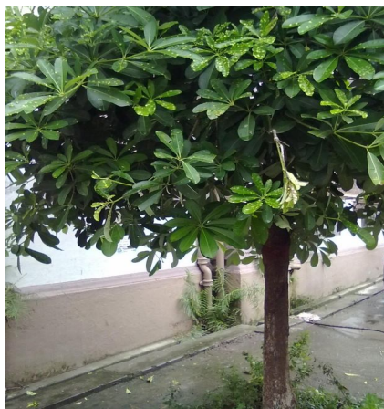
Fig 1: Alstonia scholaris habit