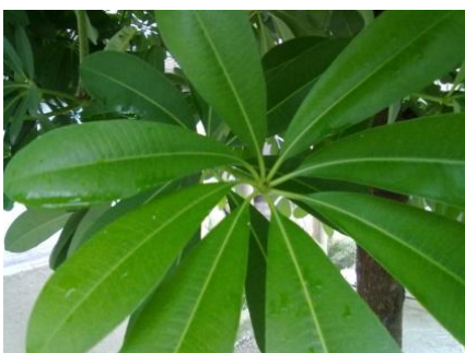
Fig 2: A. scholaris : arrangement of the leaves.