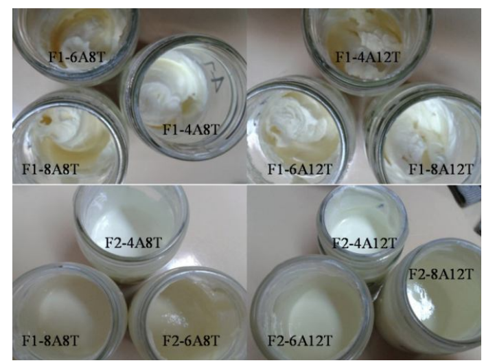
Fig. 2: Appearance of the prepared sunscreen creams.

All samples were off-white creams as seen in Fig 2. The texture of the F1 samples seemed to be stickier than that of the F2 samples. No phase separation and changing in color as well as odor were observed in all samples after stability test; however, they seemed to be more viscous.