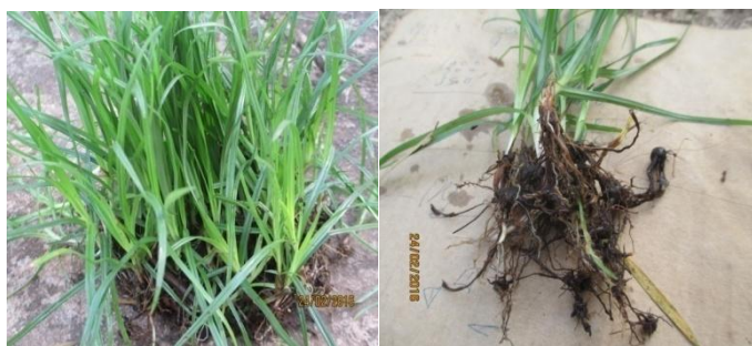
Fig. 1: Cyperus rotundus . A: Whole plant; B: Closer view of rhizome.